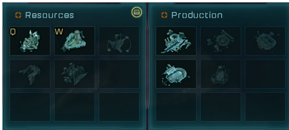
Figure 1: Engineer Construction Options

To help advanced players streamline their gameplay, Ashes of the Singularity provides a common set of hot keys based on the standard keyboard layout.