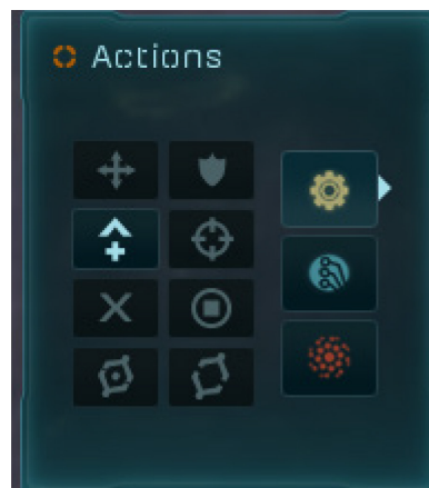
Figure 2: Unit Actions and Control Modes

QWERTY are the hot keys for the selected item's special abilities (whether that be construction, ordering reinforcements or something else).